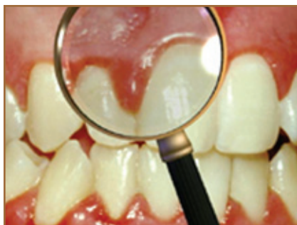
Inflamed and swollen gums

When too much bone is lost, there's so little support for the teeth, they get loose and have to be removed.