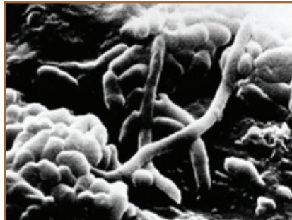
Plaque causes periodontal disease